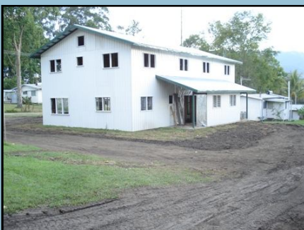
Our backyard — the new duplex!

Since our return in October of 2009 there has been non-stop construction on our corner of the center. This is a necessary step towards making room for more laborers and is usually considered a good thing. However, when you live at ground zero for an extended time it tends to wear on ones sanity.