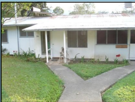
Our house on the right, construction zone on the left.