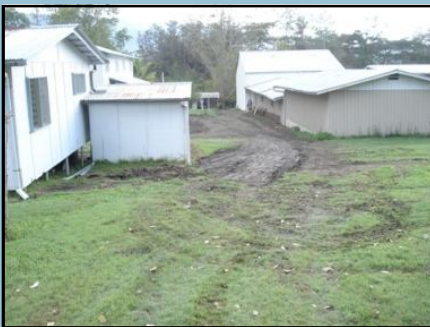
Our house on the left, Bobcat roadway on the right.